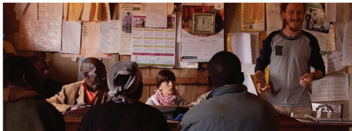
First meeting with the the village-headman and community

Cooperate for fair and sustainable development initiatives in active collaboration with disadvantaged people or communities. This process shall follow principles of human solidarity, non-discrimination and will be aimed at promoting their self-sufficiency.