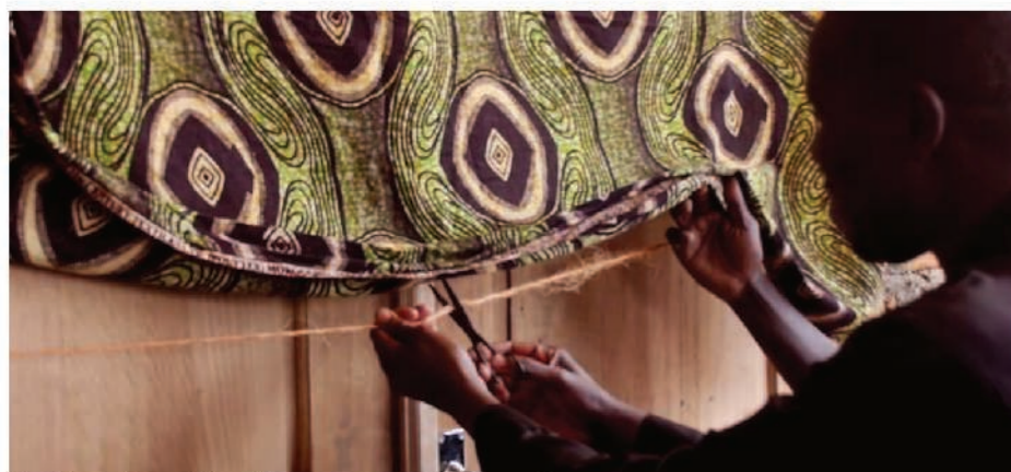
1st Day - the celebration