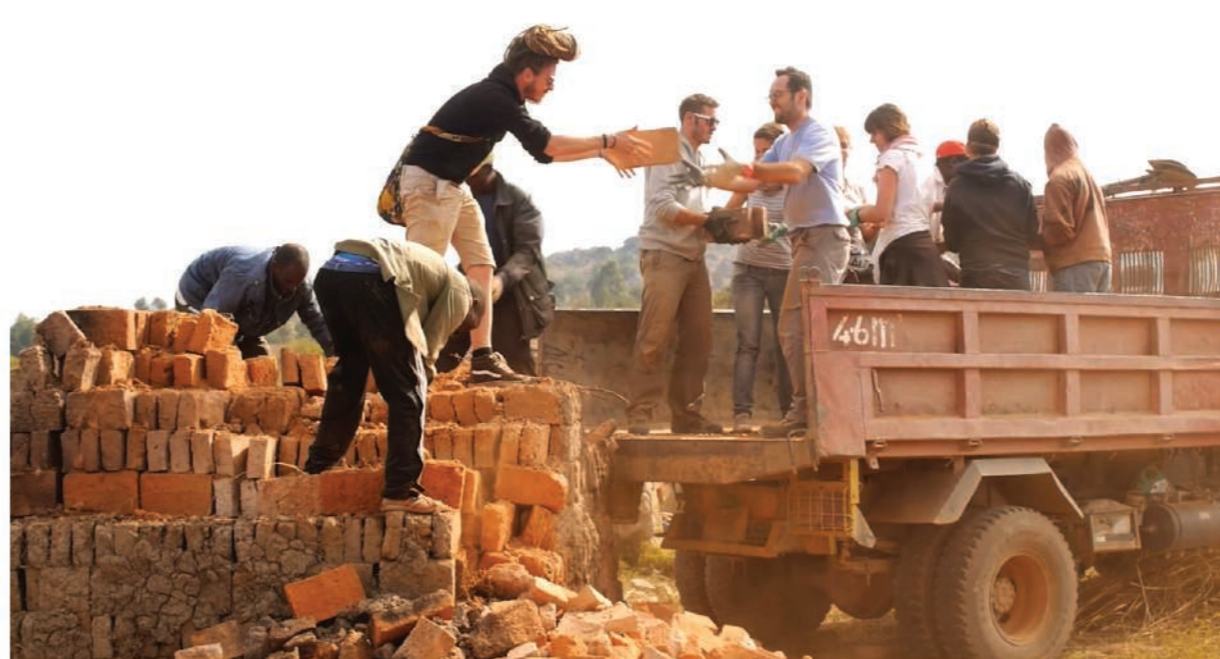
The bricks are coming for the school's walls!!!!