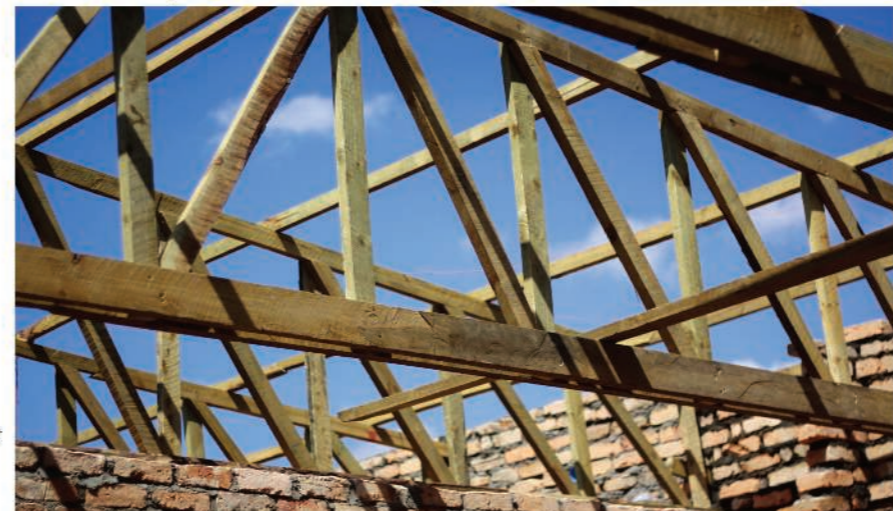
Roof structure - Timber Trusses for common area