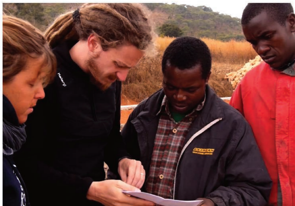
Meeting on site - coordination and the construction of the school