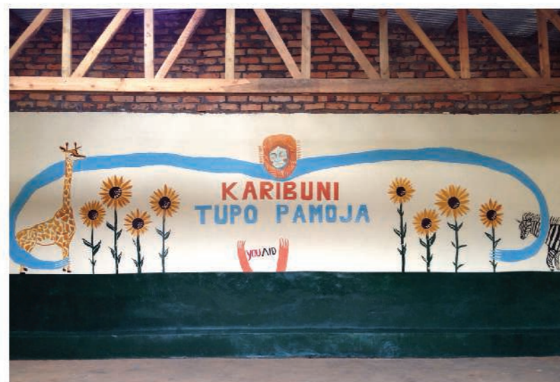
2016 - Interior of the Common area