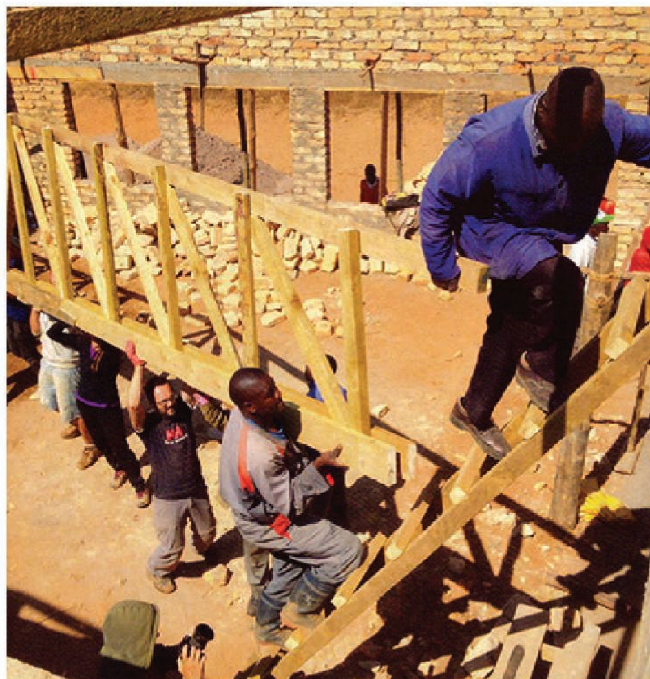
On Site - all together to build the school