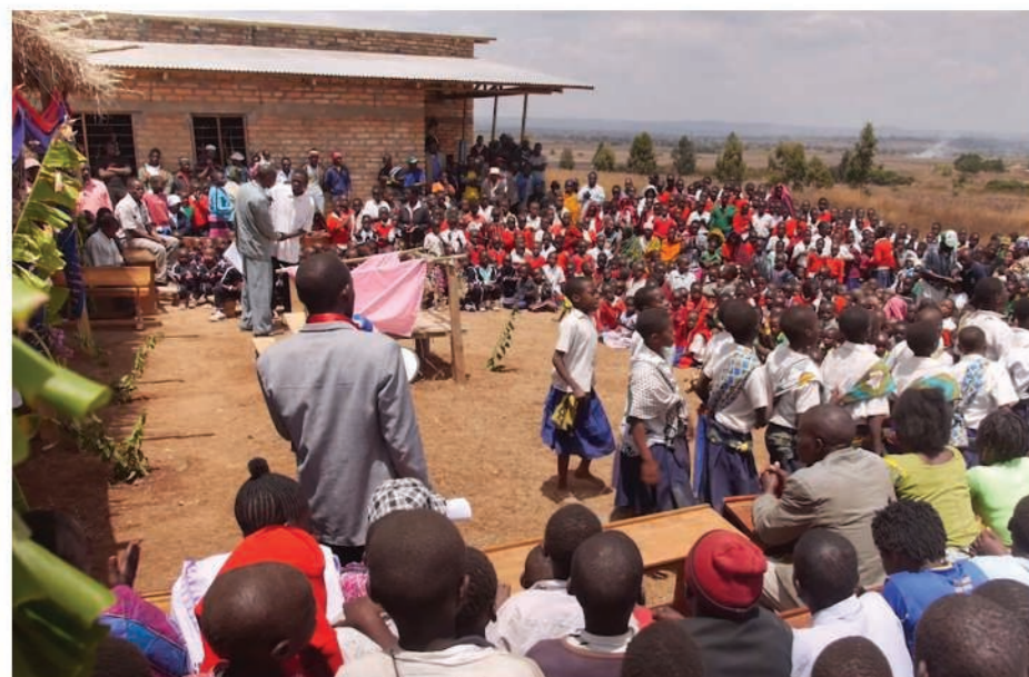
1st Day - community village and neighbours