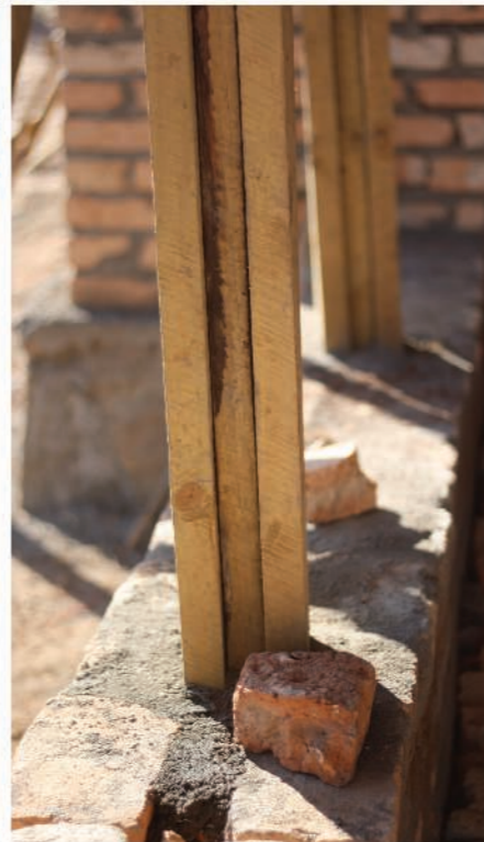
Bricks Pvc pipes - natural ventilation Pieces of bricks and rocks - Internal Floor Timber wood + metal sheet - Coverage On site - specialized construction worker Pillars detail / porch