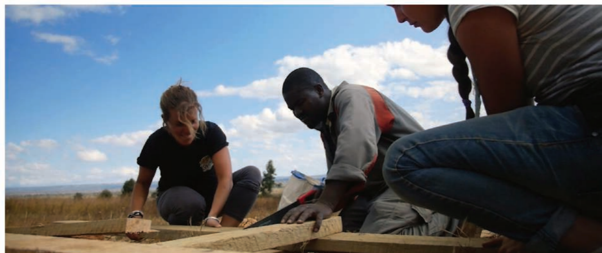
Share ideas, teach and learn : fusion of the ideas