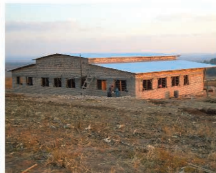
START Day num.3 Day num.10 Day num.15 Day num.25 Day num.32 THE END !

Facilitate the use of appropriate technologies, materials and labour adequate to local values, to the cultural specificity and responsive to the natural environment.